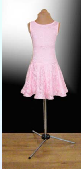
◀ Style: Isabel